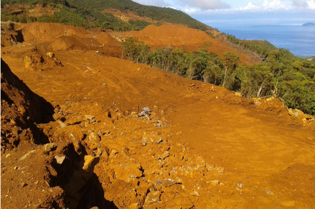
Photos showing the active mine pit at kongking area of AAM-PHIL Parcel 1 area